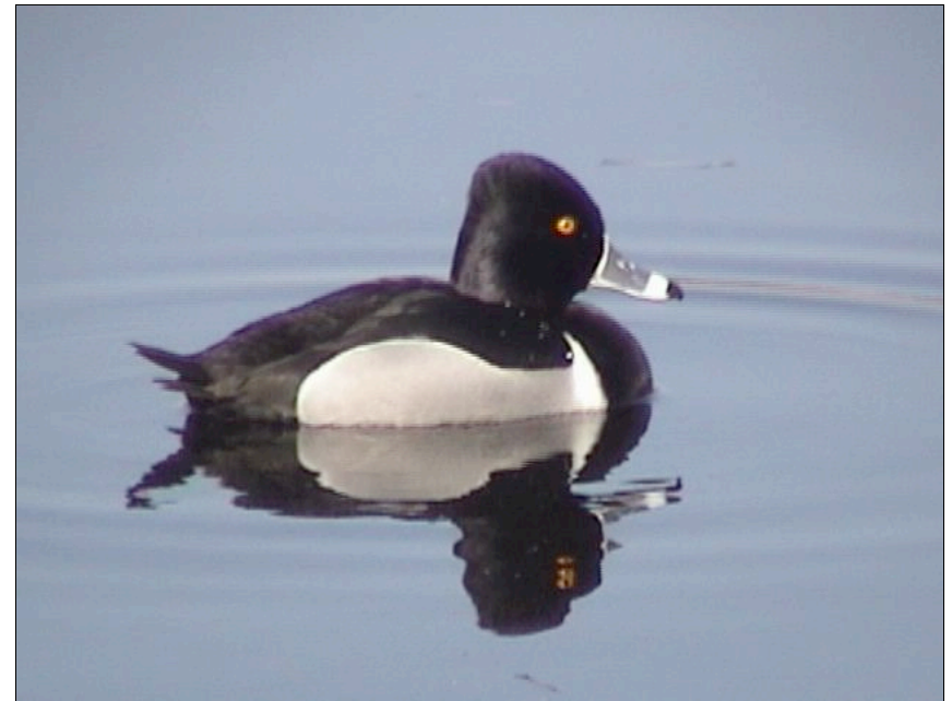
Ring-necked Duck ©